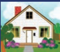
2 New Board Members needed