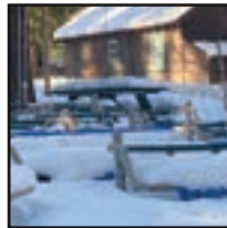
Snow covered benches

With a big storm moving in on December 14 and when Santa sent word that he couldn't make because of the snow storm the Holiday Gala was rescheduled for the next Saturday December 21. With much better weather the Gala was a wonderful success with almost 100 people showing up.