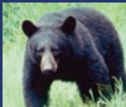
Neighborhood Neighbor, Lock your cars & houses