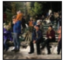
Waiting for Santa